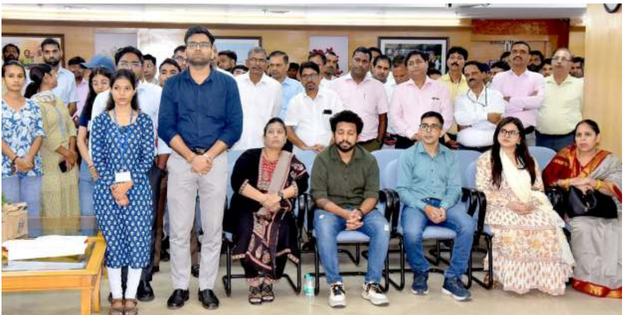
Employees and Family of the retiring employees during the ceremony.